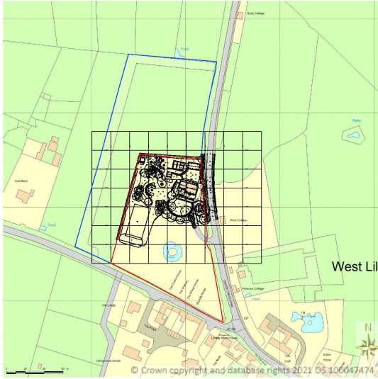
EXISTING SITE LOCATION PLAN Scale 1:2500@A3